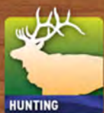
Exhibit in one or more of our Halls

Booth Prices: Single Exhibit Hall $400, Additional Hall $200